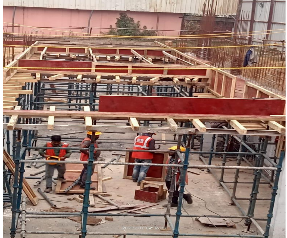
Plot Number W-4/3, W-4/9, W-4/12 & W-2/12 Substr. WIP